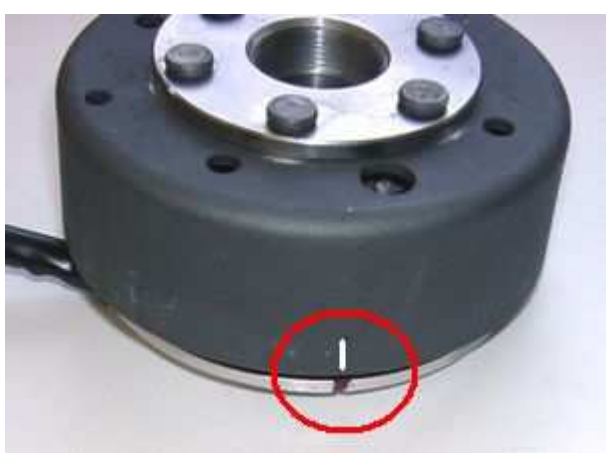
(ignition marking is here highlightend)

Should you have taken the stator completely off the plate, make sure to put it back into the same position, otherwise timing will be lost. That danger is however small, as the wire will guide you correctly on its way to the exit.