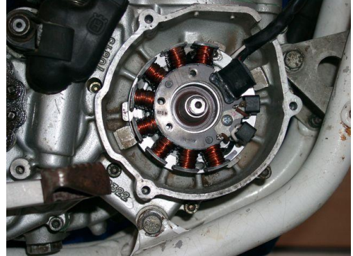
Advantage over original system