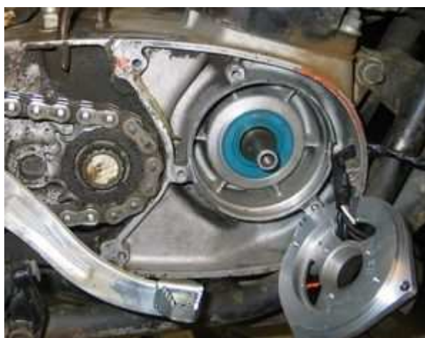
pic shows dynamo engine

Lead the stator wire through the wire exit of the engine. Place the stock rubber grommer there to prevent dirt and water entry as well as wire damage on casing edge.