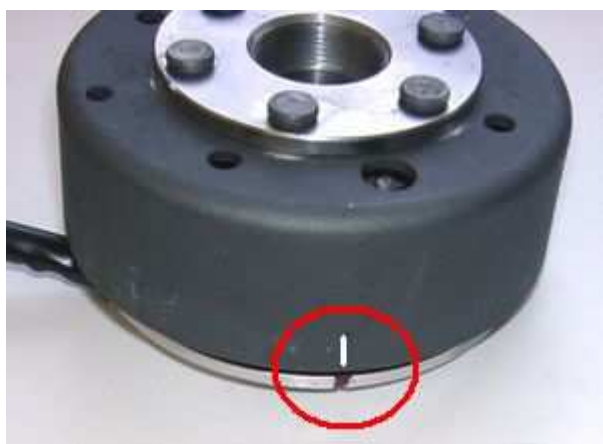
(ignition marking is here highlightend)

Place the rotor loosely onto the crank and check that it may move freely above the statorbase.