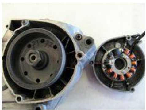
Advantage over original system:

System 771159900 (ignition only, no lighting coils)