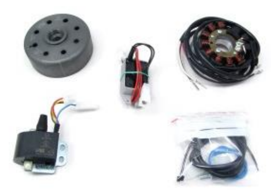
Advantage over original system: