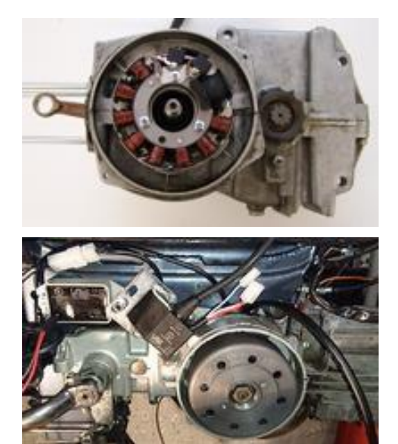
Advantage over original system: