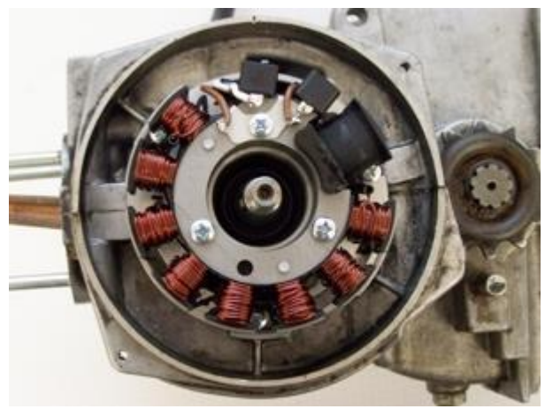
- Screw down the stator with the 3 screws M4.

- Take care not to damage the paint insulation of the stator coil.