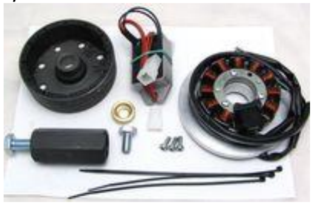
Advantages over stock system: