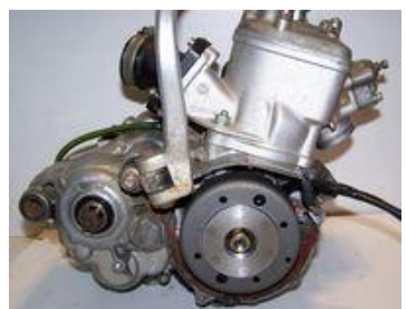
Advantage over original system: