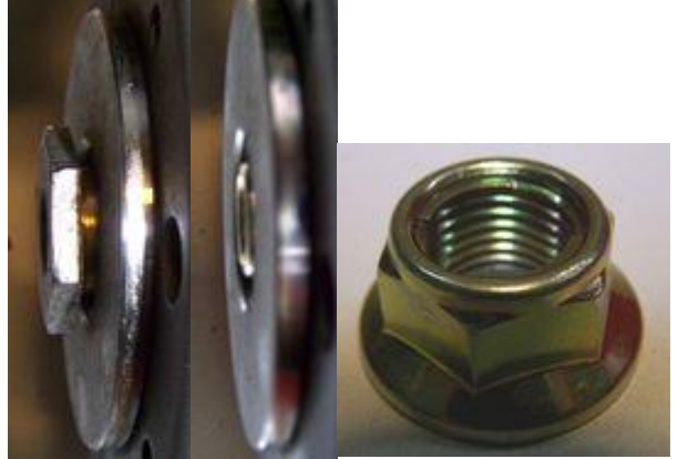
- There are smaller nuts on the market which are better suited.