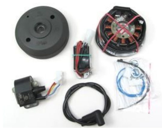
Advantage over original system