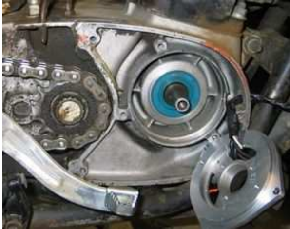
pic shows dynamo engine