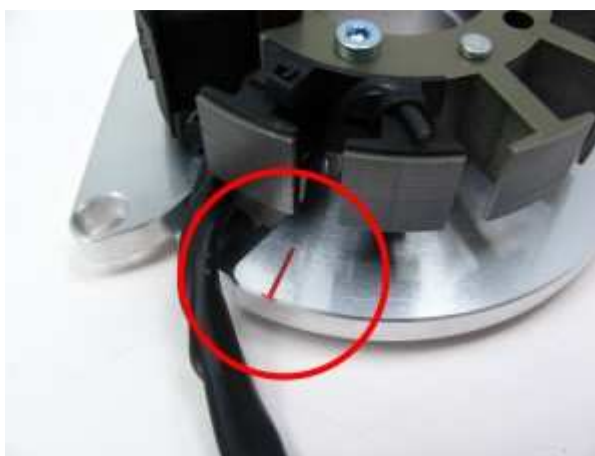
pic shows dynamo engine and stator with lighting coils

Take a look at the stator's base plate. You will find here left from the first copper coil beneath the big black coil a small carved ignition marking. Encircled red here in picture. This is a timing mark.