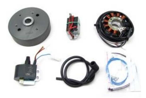
Advantage over original system: