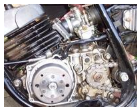
Advantage over original system: