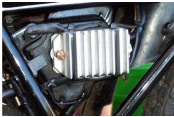
- Picture shows larger rergulator as used in older installations. Now a smaller, but as effective regulator with additional inbuild smoothing condenser is used.