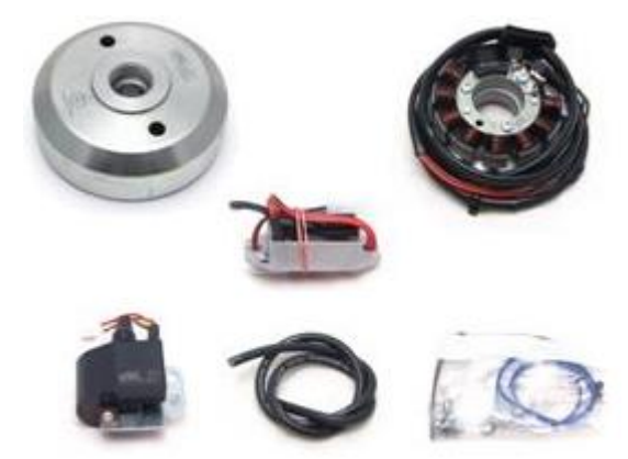
Advantage over original system: