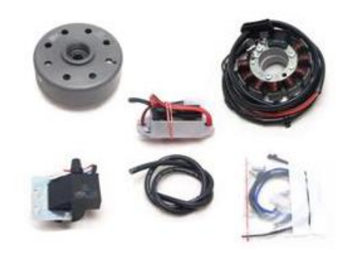
advantage over original system