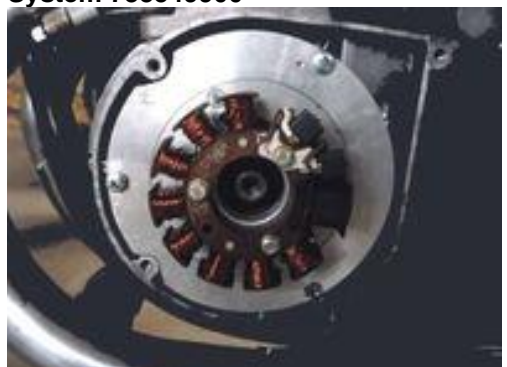
Advantages compared to the old system: