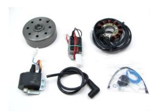
advantages over old system: