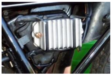
- Picture shows larger rergulator as used in older installations. Now a smaller, but as effective regulator with additional inbuild smoothing condenser is used