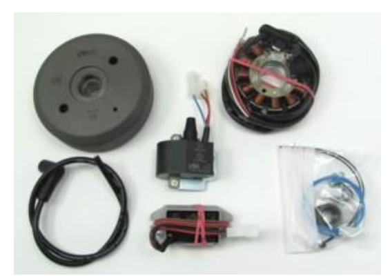
Advantage over original system: