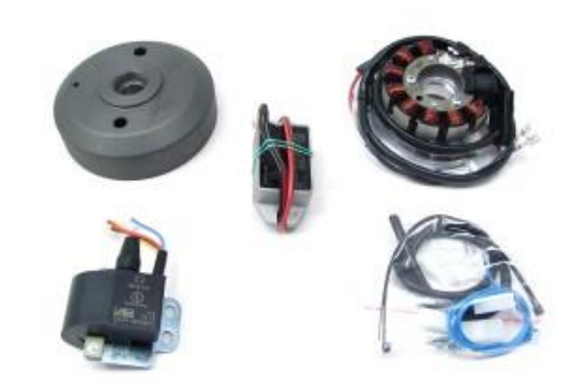
Advantage over original system