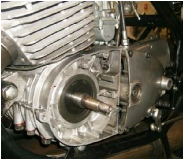
(This picture and the following are showing a similar Suzuki GT250 engine!)

- Make sure your bike rests securely on its stand, preferably on an elevated work bench and that you have good access to the generator side of the engine.